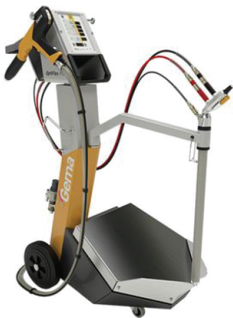
Optiflex Pro B®