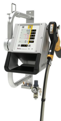
Optiflex Pro W®

The result is a perfect coating quality and always with the same result!