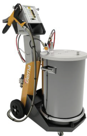
Optiflex Pro F®