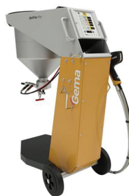
Optiflex Pro S®