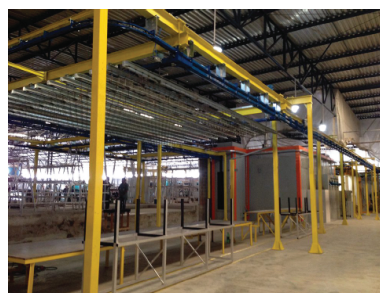
*Powder Coating Line