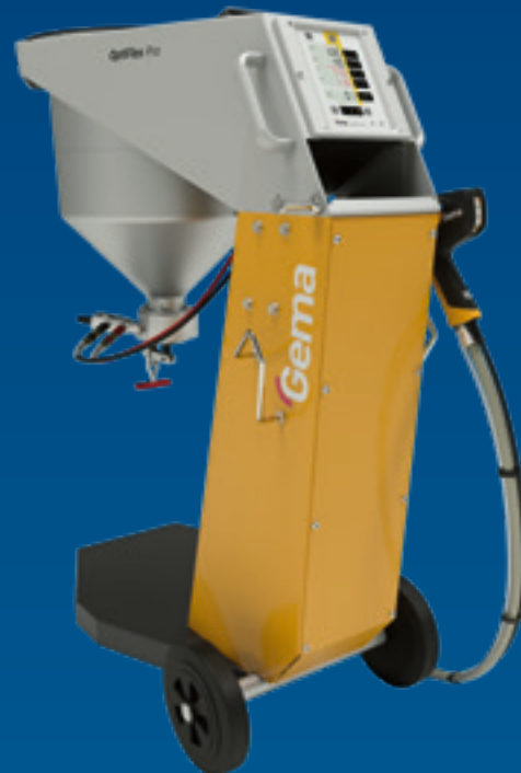
OptiFlex® Pro S