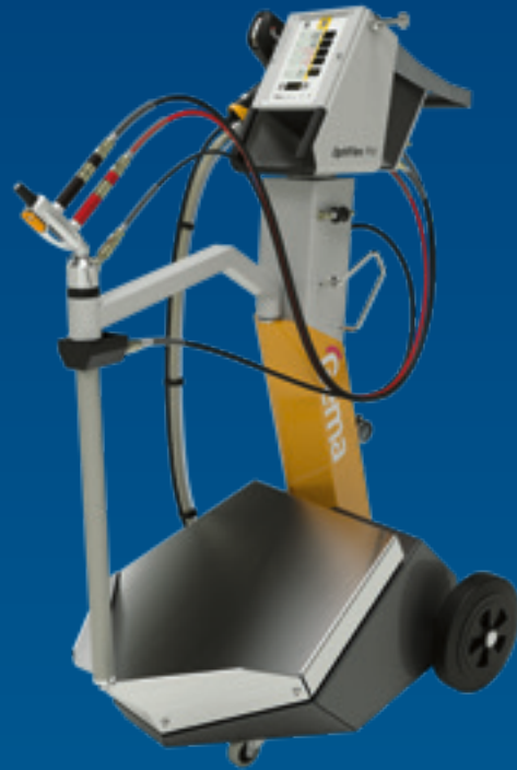
OptiFlex® Pro Q