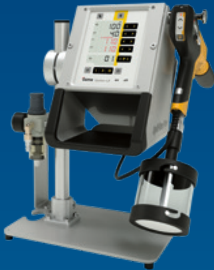
OptiFlex® Pro C