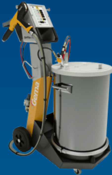
OptiFlex® Pro F