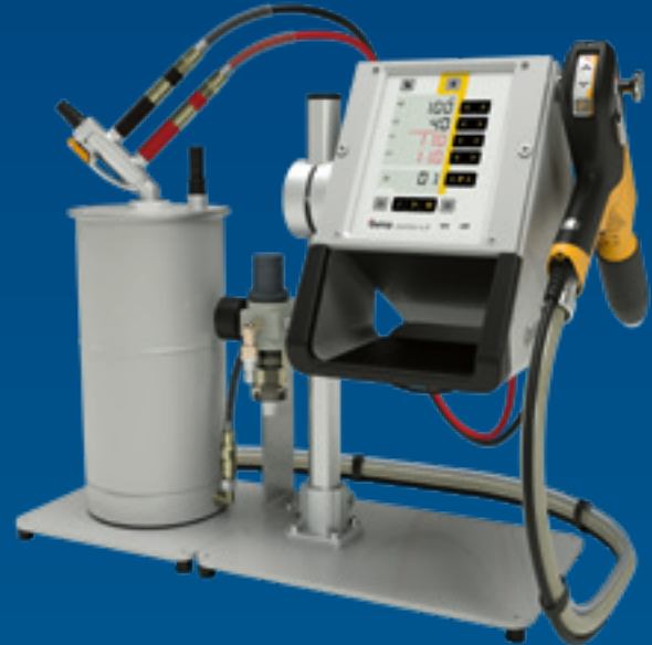
OptiFlex® Pro L