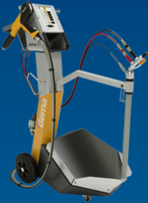
OptiFlex® Pro B