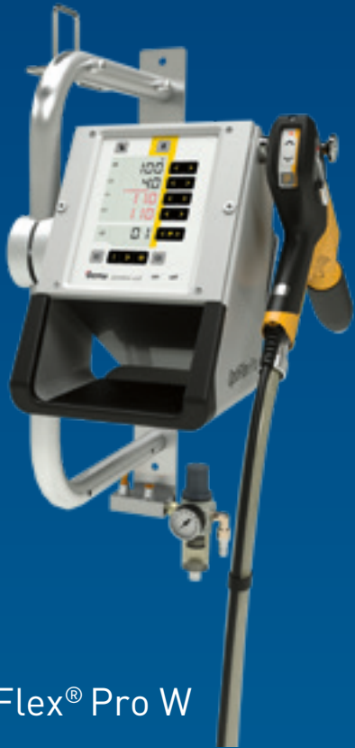
OptiFlex® Pro W