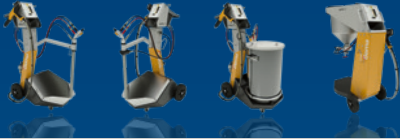
OptiFlex® Pro B OptiFlex® Pro Q OptiFlex® Pro F OptiFlex® Pro S